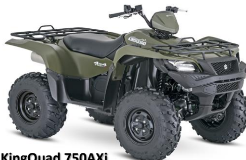
KingQuad 750AXi Power Steering Terra Green