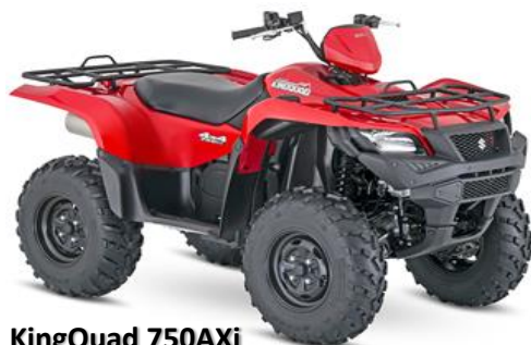
KingQuad 750AXi Power Steering Flame Red