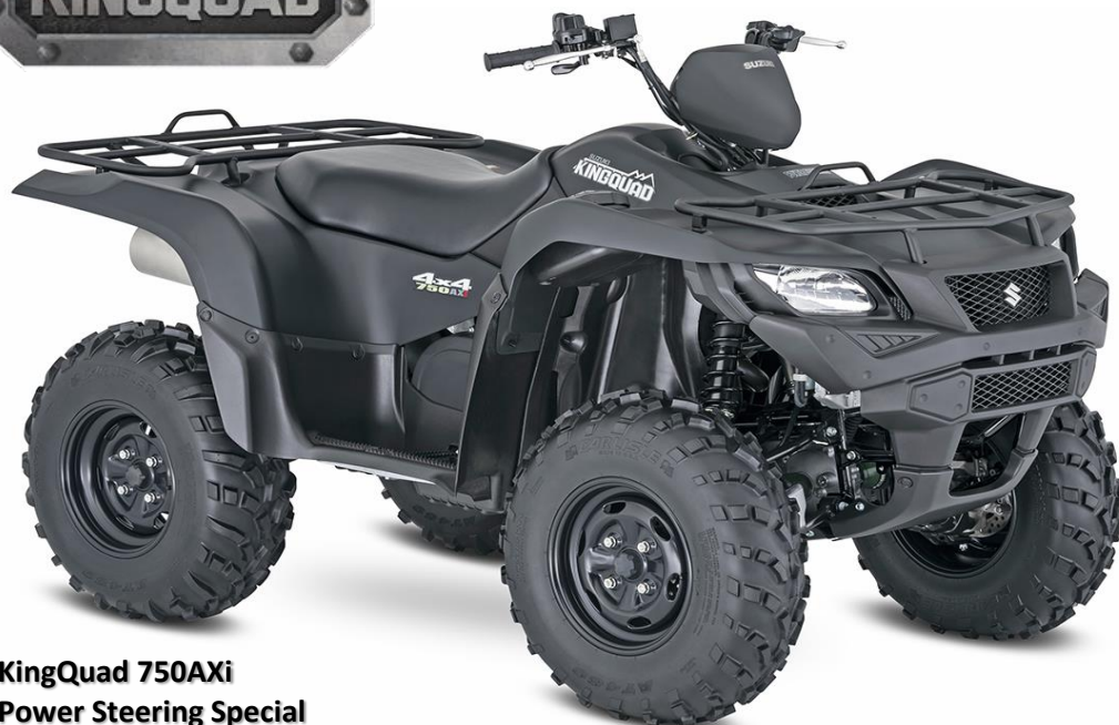
KingQuad 750AXi Power Steering Special